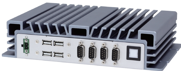
BPC-3040-1A1 front I/O

Fanless Embedded Box PC with Intel® Apollo Lake Pentium® N4200 Processor, Support -20~ 70°C Operation Temperature