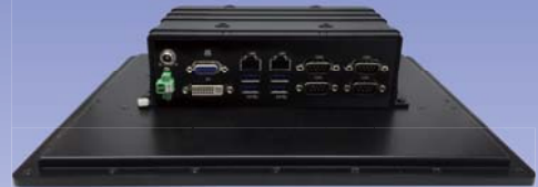
31385CW Back Panel