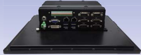
31385CW Back Panel (Option)