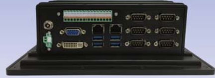
31385CW Back Panel (Option)