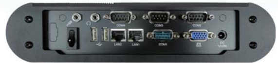
31847A Back Panel

M/B information: ( Please refer to M/B specification )