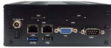
2I386EW / 2I385EW + L2M001 Back Panel