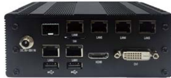
2I390CW + L2L002 Back Panel