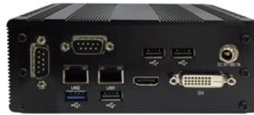
2I390CW Back Panel