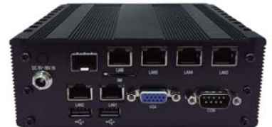
2I386EW / 2I385EW + L2L002 Back Panel