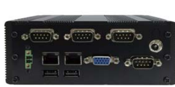
2I386EW / 2I385EW / 2I385CW Back Panel