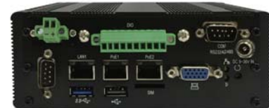
2I380NX Back Panel

M/B information: ( Please refer to M/B specification )