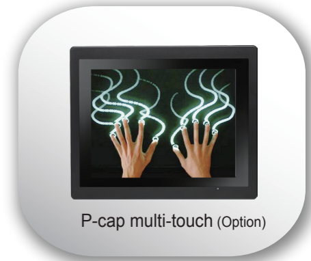
P-cap multi-touch (Option)