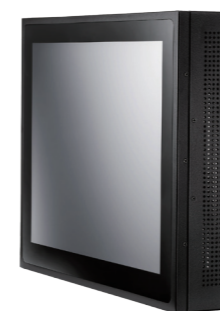
WLP-7D20-17 CKPT CKFT