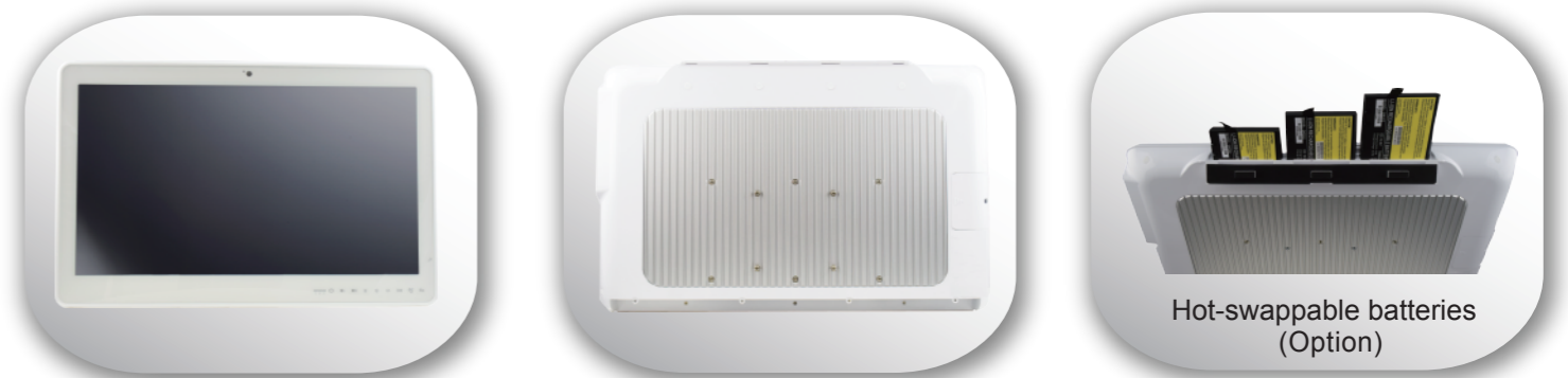
Hot-swappable batteries (Option)