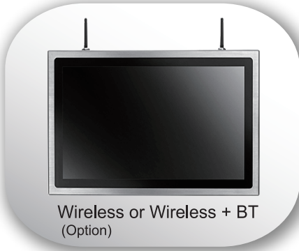
Wireless or Wireless + BT (Option)